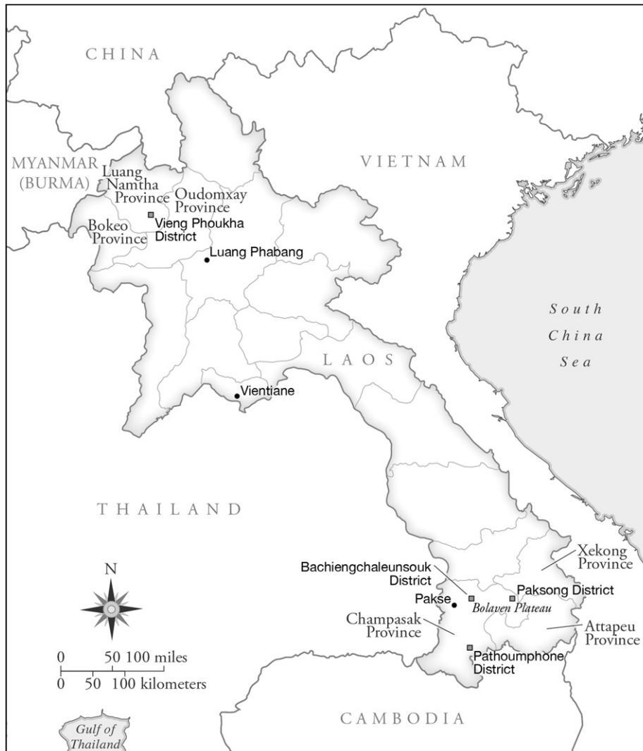
Fig. 1. Places in Laos mentioned in this article.

places of belonging that situate local identities within historicized national territory. Place-based identities are, for example, mobilized through the political currency of historicized 'national' heroism (see Evans, 1998; Pholsena, 2006; Tappe, 2011). This transcalar claim, between local and national historical narratives, involves spaces defining 'local' identities which are reinscribed within the 'national' territory and history for the purpose of resisting 'global' land-based economic projects. Memories are thus politically actualized by turning spaces, such as those of indigeneity, into birthplaces of national heroism to resist global capital. As such, we argue, memories of a war that supposedly ended in 1975, but actually continued on for many years after, are contributing to shaping contemporary rural landscapes in Laos. Hopefully this article will contribute to debates about 'post-conflict' land allocation and spur organizations and researchers working on land issues to address how politicized memories affect contemporary land and other resource allocation and use.